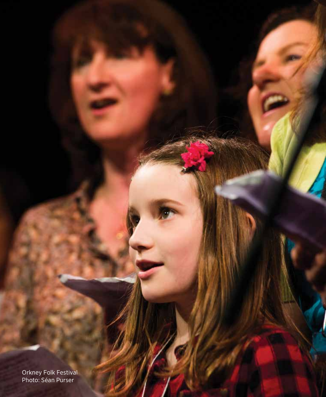
Orkney Folk Festival