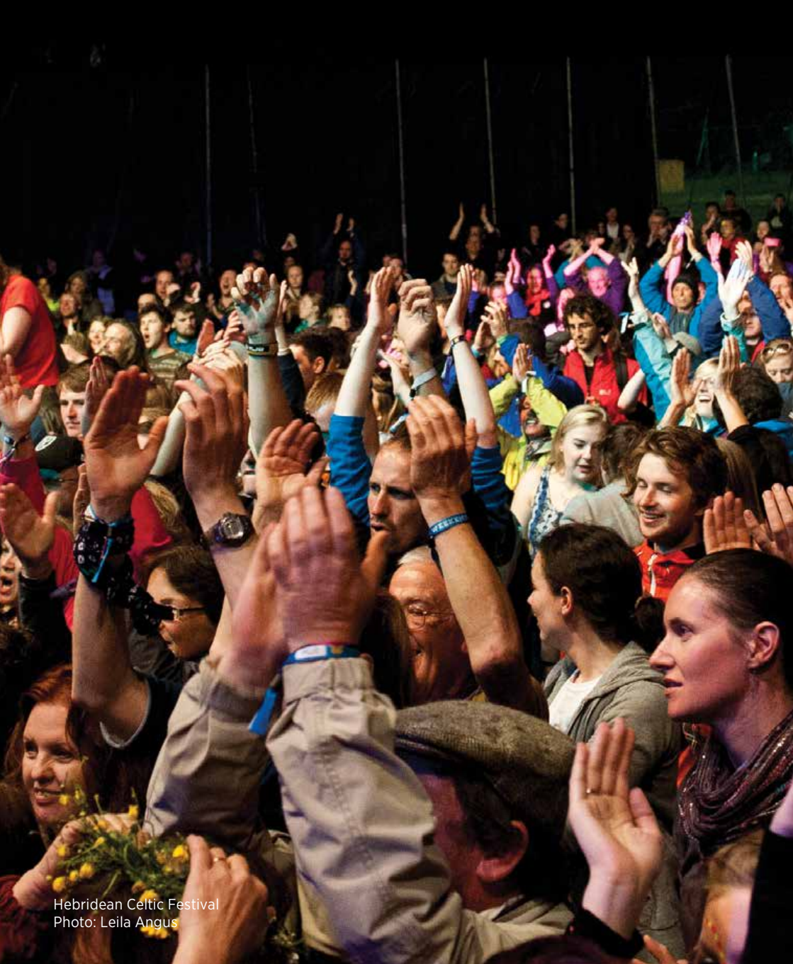
Hebridean Celtic Festival